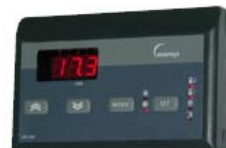
Remote control panel